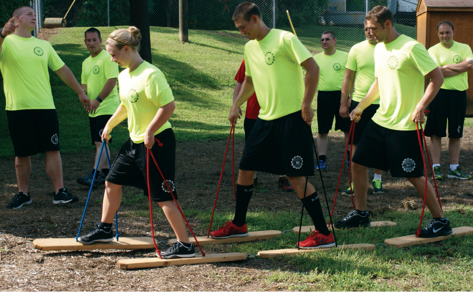
Cadets meet rigorous physical and academic demands in the Law Enforcement Academy.